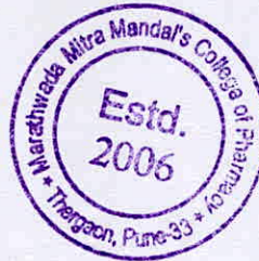
Principal Marathwada Mitra Mandal's COLLEGE OF PHARMACY Thergaon (Kalewadi), Pune-411 033

----- building Pharmacy Professionals through Education par Excellence