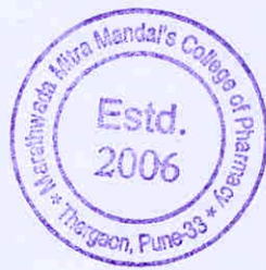
Principal Marathwada Mitra Mandal's COLLEGE OF PHARMACY Thergaon (Kalewadi), Pune-411 033

----- building Pharmacy Professionals through Education par Excellence